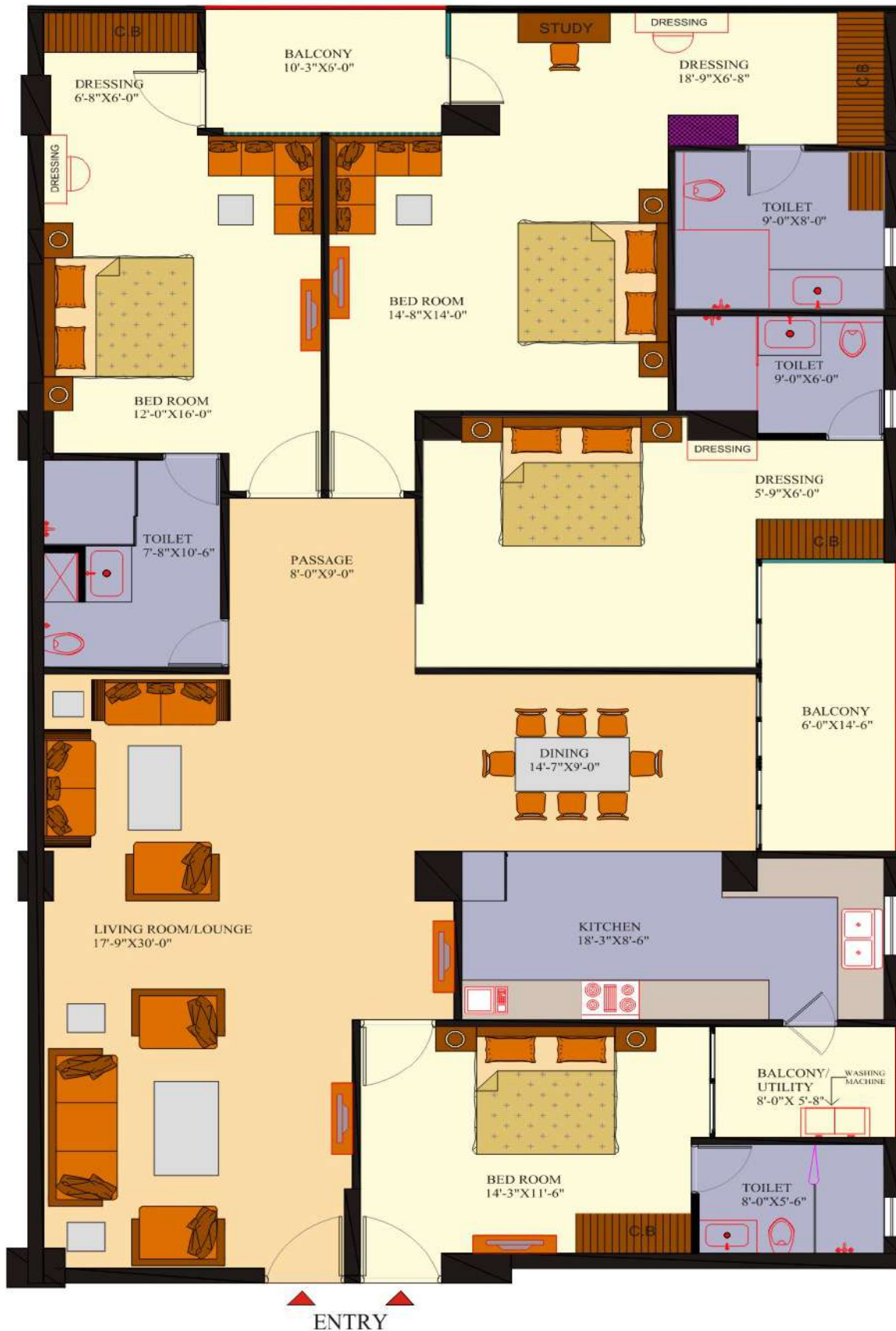
FLOOR PLAN 4 BHK (JH-11) BLOCK - G,H,I,J,K

BUILT UP AREA - 2400 SFT. CARPET AREA - 2110 SFT.