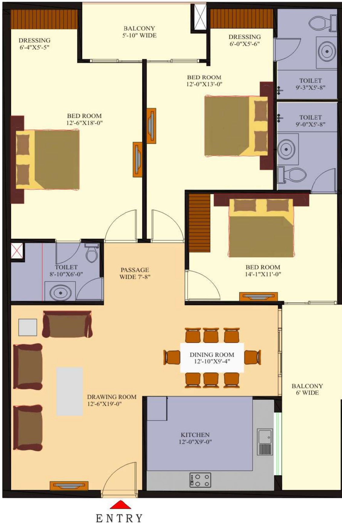
FLOOR PLAN 3 BHK (JH-II) BLOCK - A,B,C JH-II EXTENSION BLOCK - L,M,N

BUILT UP AREA - 1600 SFT. CARPET AREA - 1340 SFT.