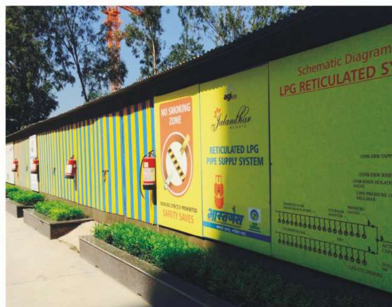
LPG RETICULATED SYSTEM