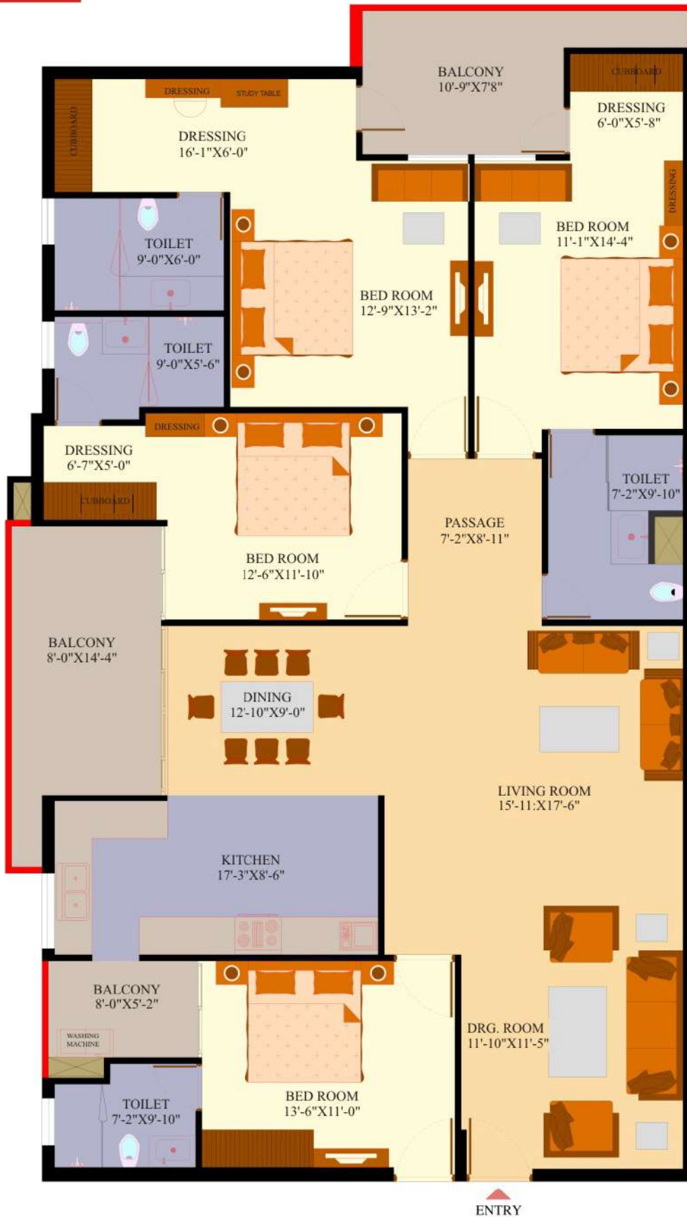
FLOOR PLAN 4 BHK (JH-II) EXTENSION BLOCK - O,P,Q

*Note : Plan may change as per the actual approval.