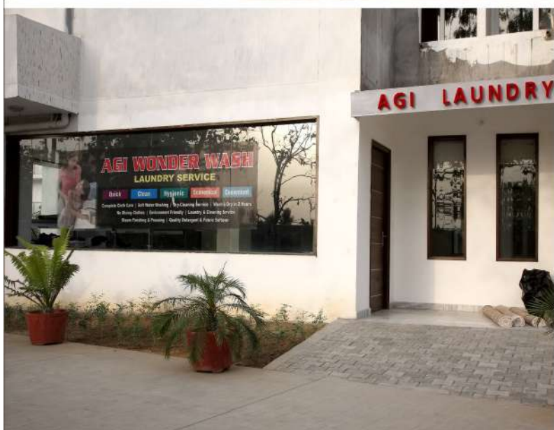
AGI WONDER WASH LAUNDRY SERVICE